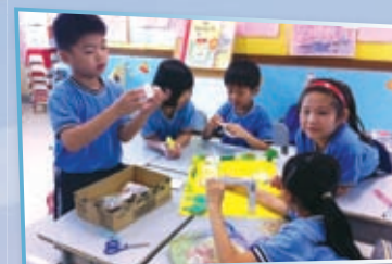
一年級同學製作公園模型 P. 1 students – making models of their dream parks

● 透過服務學習活動，讓學生獲得親身的學習經驗，從而作出反思，培養學生承擔精神。Cultivate students' learning experience, self-reflection and responsibility by taking part in promoting community service.