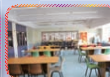
探究天地 Science Room