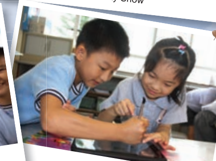
平板電腦輔助學習 Assistant learning with I-Pads