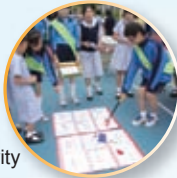
普通話活動 Putonghua activity