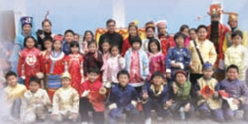
中國文化日 Chinese Cultural Day

Emphasize on understanding Chinese culture. Chinese Cultural Day is organized annually with different themes, e.g. Chinese opera, Chinese calligraphy, Chinese cuisine, etc.