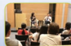
校長與家長閒談會 Headteacher-parents Forums

Our school has set up the Parent-Teacher Association and Incorporated Management Committee (IMC). Mutually supportive relationship between the school and parents is cultivated through the four meetings with PTA and the three meetings with IMC every year, Parents' Day, Parents' Talks, Parent-child Outdoor Learning Day and Headteacher-parents Forums. Parents also play an active role in school activities.