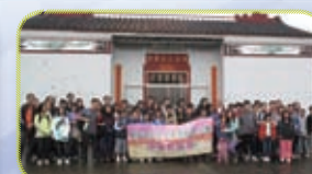
親子旅行 Parent-child Outdoor Learning Day