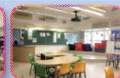
英語活動室 English Activity Room