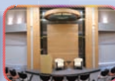
演講廳 Lecture Theatre