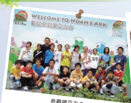
參觀挪亞方舟 The visit to Noah's Ark