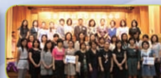
家長教師會 Parent-Teacher Association