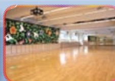
舞蹈室 Dance Room