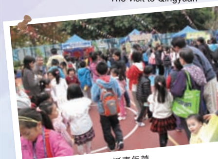
聖誕嘉年華 Christmas Carnival