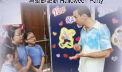
萬聖節派對 Halloween Party 與外籍英語老師進行活動 English activities with our NET