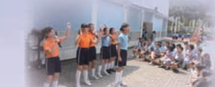
E-Kids 逢星期五均會協助英文科活動的進行 English activities on every Friday