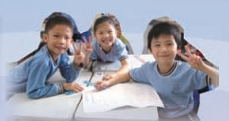
專題研習課 Project learning