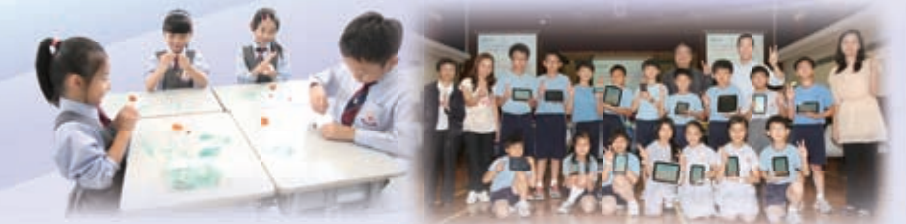
積極參與課堂活動 Active participation in learning activities

Provide abundant teaching resources to ensure that students first learn concrete concepts from daily life then learn the abstract concepts. Emphasize on the development of higher order thinking, participation, expression and creativity.