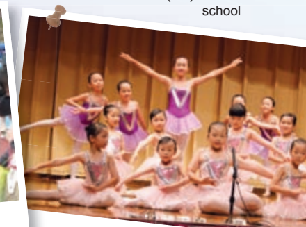
天才橫溢匯演 The Variety Show