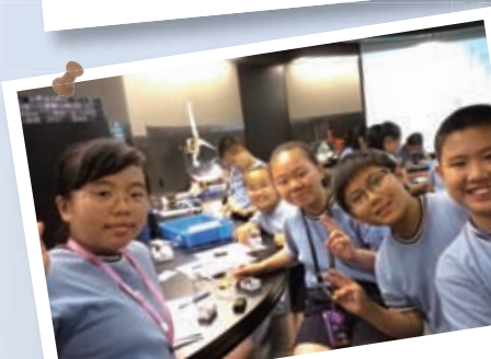
參觀香港科技園 The visit to Hong Kong Science & Technology Parks