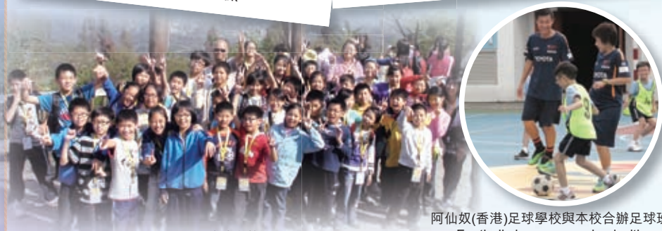
清遠之旅 The visit to Qingyuan