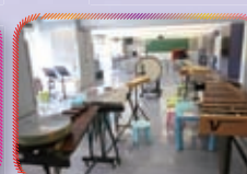
音樂室 Music Room

校址 Address : 將軍澳學林里八號 (將軍澳圖書館側) 8 Hok Lam Lane, Tseung Kwan O (Next to Tseung Kwan O Public Library) 電話 Telephone : 2706 1336 傳真 Facsimile : 2706 9336 網址 Website : http://www.wyjimps.edu.hk 電郵 E-mail : mail@wyjimps.edu.hk