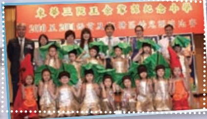
西貢及觀塘區幼兒朗讀比賽 Reading Aloud Competition for kindergarten students