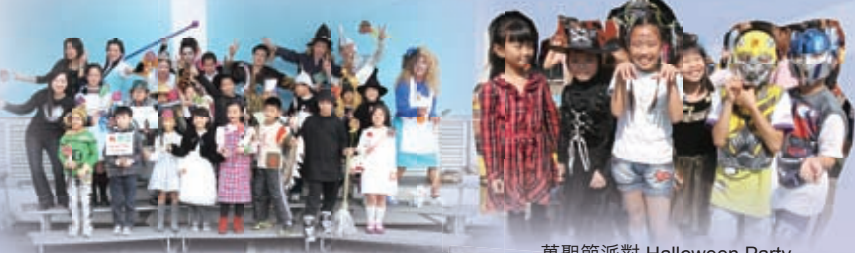
英語活動日 English Day – The Wizard of Oz

Create an English-rich environment by organizing fun activities, such as English Day, Halloween Activity Day, Christmas Carnival, Easter Activities and English Friday. Students also participate in School Drama Festival to learn English through drama.