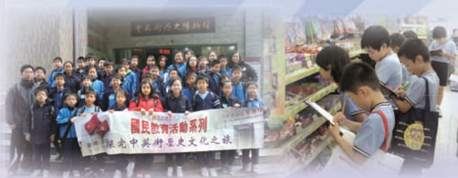
探究中英街歷史文化之旅 The visit to Chung Ying Street