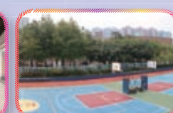
跑道 Running Track