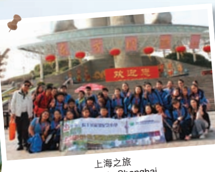
上海之旅 The visit to Shanghai