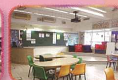
英語活動室 English Activity Room