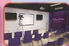
遠程教室 Distance Learning Classroom