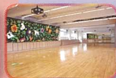
舞蹈室 Dance Room