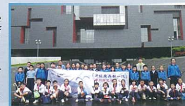
「才俊飛昇」資優培育計劃 Talent Programme

● 與香港資優教育學苑協作發展校本資優教育。Collaborate with The Hong Kong Academy for Gifted Education to develop Gifted Education.