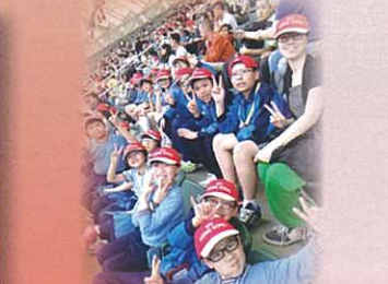
參觀欖球比賽 Watching Hong Kong Sevens