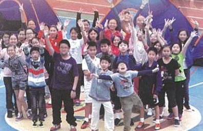
制服團隊——三軍大露營 Uniform Groups Camping