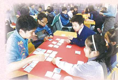
專題研習 Project Learning

● 著重培養同學的科學探究精神，學生經常進行探究及實驗活動。Carry out exploratory and experimental activities to develop scientific enquiry learning.