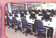
多媒體教學室 Multi-Media Teaching Room