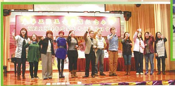
家長教師聯歡晚會——盆菜宴 PTA Annual Dinner - Big Bowl Feast