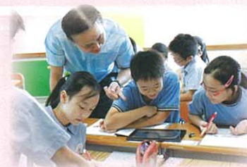
積極參與課堂活動 Active participation in class activities

Provide abundant teaching resources to ensure that students first learn concrete concepts from daily life then learn the abstract concepts. Emphasize on the development of higher order thinking, participation, expression and creativity.