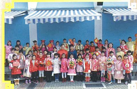
中國文化日 Chinese Cultural Day

Emphasize on understanding Chinese culture. Chinese Cultural Day is organized annually with different themes, e.g. Chinese opera, Chinese calligraphy, Chinese cuisine, etc.