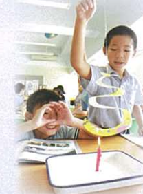
科學實驗 Science Experiment