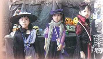
萬聖節派對 Halloween Party