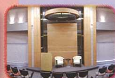
演講廳 Lecture Theatre