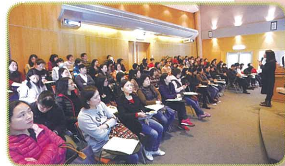
家長講座 Parents Seminar

Our school has set up the Parent-Teacher Association and Incorporated Management Committee (IMC). Mutually supportive relationship between the school and parents is cultivated through the four meetings with PTA and the three meetings with IMC every year, Parents' Day, Parents' Talks and Parent-child Outdoor Learning Day. Parents also play an active role in school activities.