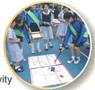
普通話活動 Putonghua activity