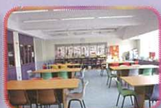
探究天地 Science Room