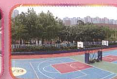
跑道 Running Track