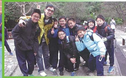
教育營 Education Camp