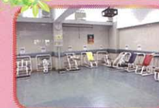
健身室 Fitness Room