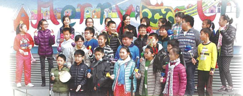
聖誕聯歡 Christmas Party