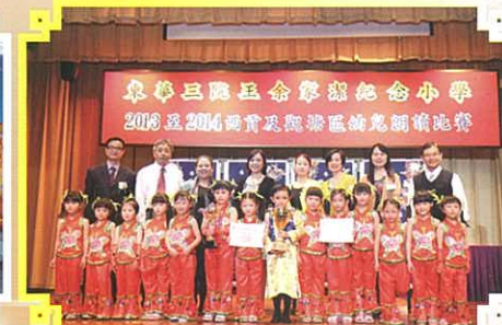
西貢及觀超區幼兒朗讀比賽 Young Children Read Out Loud Competition (Sai Kung and Kwun Tong District)