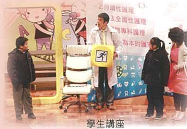
學生講座 Students Seminar