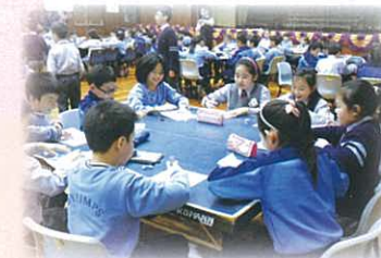
校內速算王比賽 School-based Maths Competition