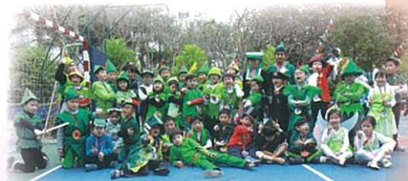
英語活動日 English Day - Peter Pan

Create an English-rich environment by organizing fun activities, such as English Day, Halloween Activity Day, Christmas Carnival, Easter Activities and English Friday. Students also participate in School Drama Festival to learn English through drama.