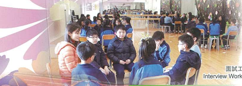
面試工作坊 Interview Workshop