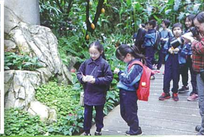
戶外學習日 Outdoor Learning Day