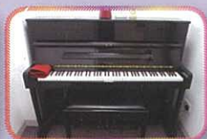
四個鋼琴室 4 piano rooms