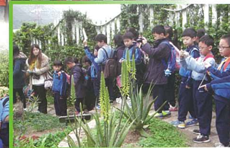
專題日活動 Project Learning Day