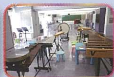
音樂室 Music Room

校址 Address : 將軍澳學林里八號 (將軍澳圖書館側) 8 Hok Lam Lane, Tseung Kwan O (Next to Tseung Kwan O Public Library) 電話 Telephone : 2706 1336 傳真 Facsimile : 2706 9336 網址 Website : http://www.wyjimps.edu.hk 電郵 E-mail : mail@wyjimps.edu.hk