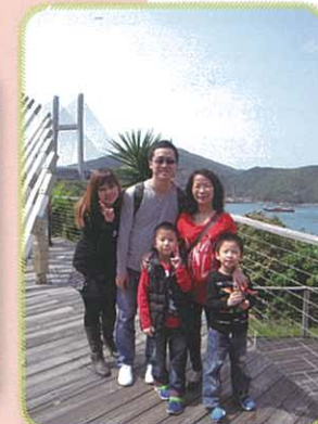
家教會活動 PTA activities